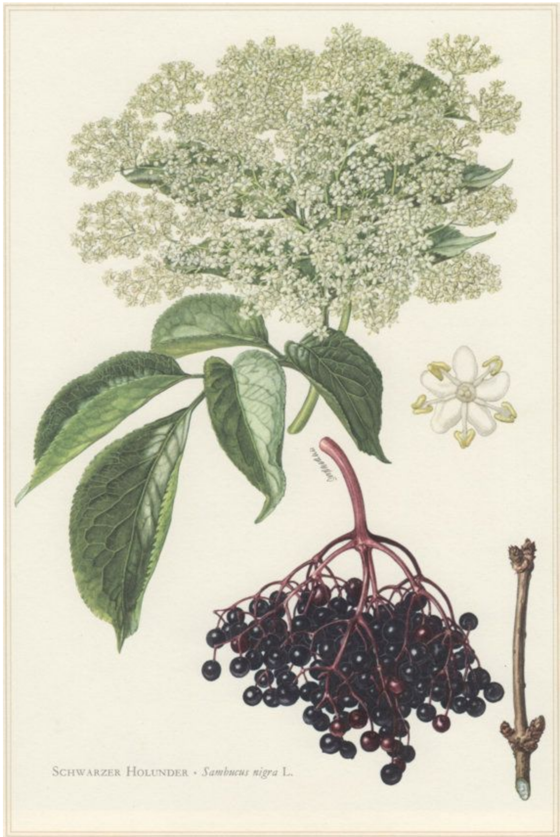
SCHWARZER HOLUNDER • Sambucus nigra L.