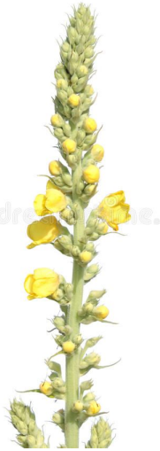
mullein Verbascum thapsis