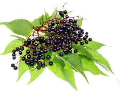
elder [berry + flower] Sambucus nigra