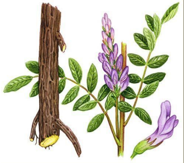
licorice Glycyrrhiza glabra