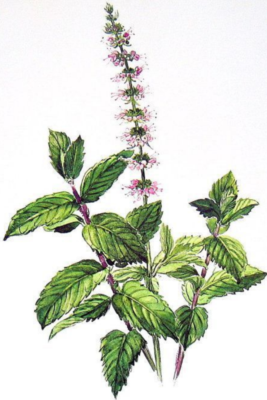
Mint Mentha longifolia

. . . for ye pay tithe of mint . . . MATTHEW 23:23