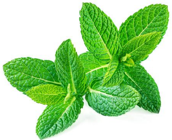
spearmint Mentha spicata