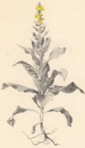
GROSSBLÜTIGE KÖNIGSKERZE · Verbascum thapsiforme SCHRAD.